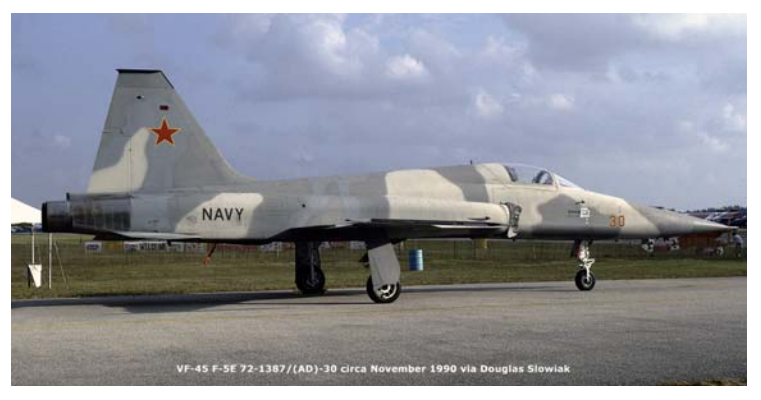
The PCAM F-14 Tomcat, F-16 Viper, and F-5 Tiger II are all on Ioan from the National Naval Aviation Museum at Pensacola, Florida. 😒

This aircraft was used by the Naval Fighter Weapons School or "Topgun", later the Naval Strike Air Warfare Center or NSAWC. Rumor has it that our F-5 starred in the 1986 blockbuster movie "Top Gun" but this is incorrect. She was still with the U.S. Air Force when that movie was made.