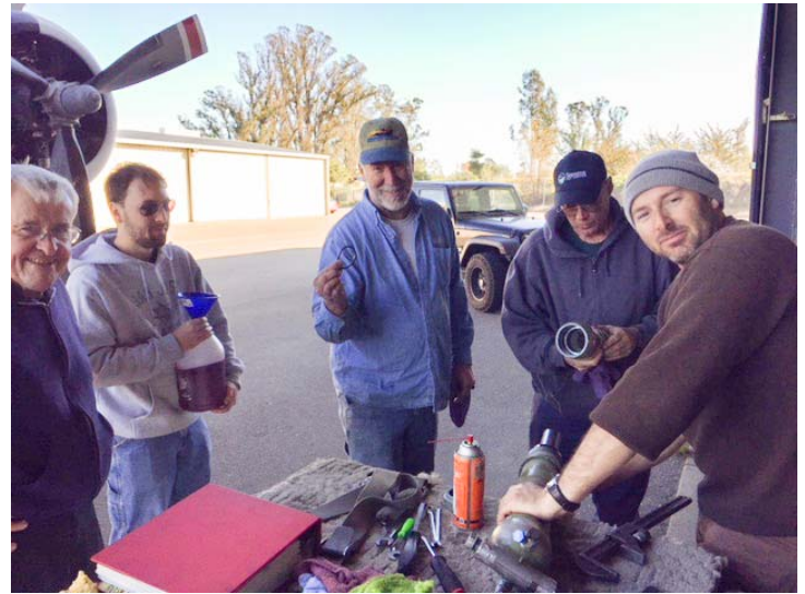
C-IA crew overhauls a leaky wing fold cylinder.