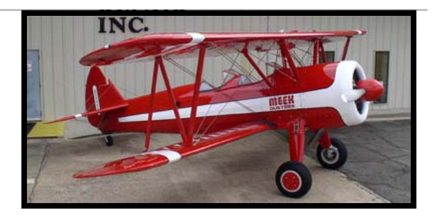
The Stearman PT-17