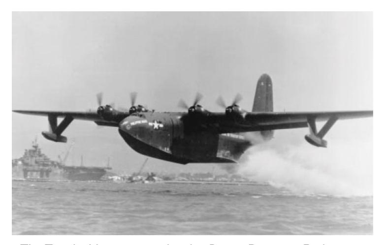
The Topeka Mars, equipped with a Pigeon Direction Finder navigational aid, takes off from the Alameda Naval Air Base.

One Navy test crew had mixed reviews, blaming the device for throwing them off course during a flight between Rio De Janeiro and Pensacola. On the other hand, they praised it as a ready source of protein during the week they spent in the Galapagos Islands before search and rescue teams found them.