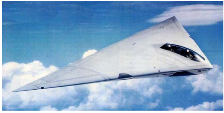
An artist's conception of the A-12 Avenger II or "Flying Dorito".