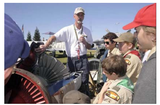
One of our expert docents explains jet propulsion to a group of Boy Scouts.

The months of February and March have seen a growth in activity that has been consistent for PCAM for some time now. Specifically, the increase