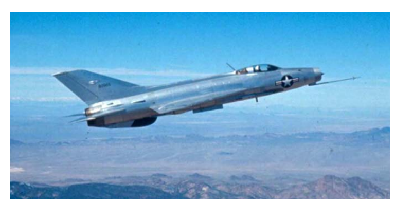
A USAF F-110B. Actually, this is a Soviet MiG-21 flown by the 4477<sup>th</sup> "Red Hats" Squadron for testing and evaluation, and to train other American and allied pilots.

Ever seen an F-110B? How about an F-113 or F-116? These are the designations given to captured Soviet aircraft which are or were flown out of Area 51 for