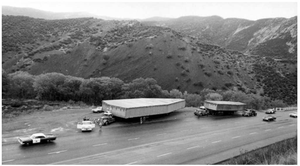
The A-12 was fast. Here's the prototype, getting a ticket on its way from the factory in Burbank to Area 51. Actually, the big box contains a large piece of the A-12, and the California Highway Patrol stopped the truck when its oversize load impeded traffic.