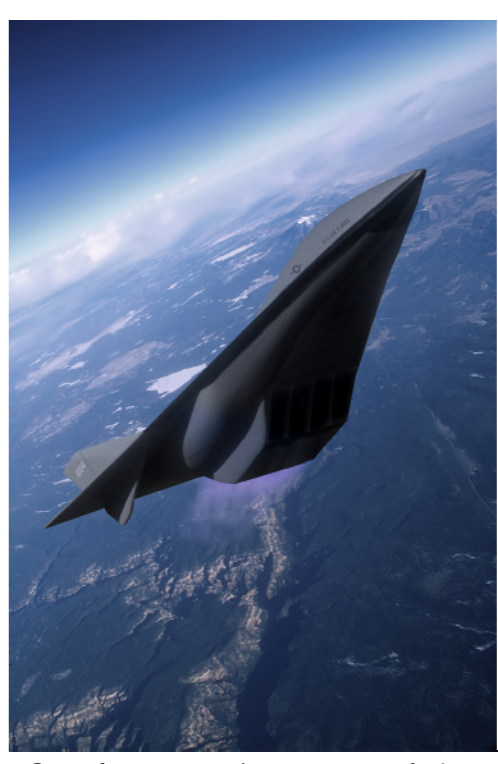
One of many artists' conceptions of what Aurora might look like.

The McDonnell-Douglas (now Boeing) Bird of Prey was a stealth demonstrator. It first flew in 1996 and was retired in 1999.