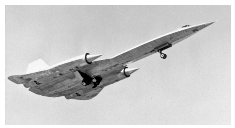
One of the seminal moments in "black" aircraft history: the prototype Lockheed A-12 takes flight for the first time at Area 51. Later, this and the other A-12s were actually painted black.

Area 51 is where most of the more interesting, and many of the unknown advanced U.S. Air Force aircraft are tested. This generally includes ultra-secret "black" projects, many of which later became public knowledge including the U-2, SR-71, Tacit Blue, and drones. The wide expanses of the Nevada desert and generally clear weather provide the perfect location for such secretive testing. And the Nellis range itself is the size of New England (if you leave off Maine) so there is plenty of space to fly secret aircraft far from overly observant aircraft buffs, military analysts, and foreign spies.