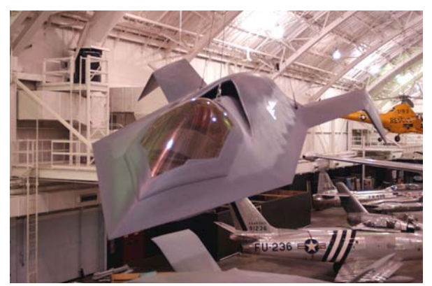
The Bird of Prey was named after Klingon ships from the Star Trek series. Only one Bird of Prey was built, as a test bed for stealth technology.

Rumors and speculation abound regarding the possibility that the Department of Defense keeps captured alien spacecraft and even the aliens themselves at Area 51. During the '80s and '90s the public roads and public lands bordering Area 51 were often peopled by UFO spotters, but this trend has declined in the last decade or two. Bill described a recent trip up Nevada State Route 375, "The Extraterrestrial Highway", which is the nearest major public road to Area 51. There is a small roadside diner called the Little A'Le'Inn in the town of Rachel Nevada, where UFO researchers, black aircraft spotters, and other curious folks like to refresh themselves between rounds of sky watching. And of course there is the unmarked gravel access road to Area 51. This road is a tourist attrac-