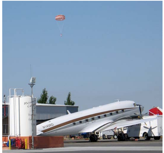
During one test, wind drift varied significantly from predictions and the canister made it all the way back to the airport. Note the re-engine turbo-powered DC-3 with five-bladed props.

The engine uses an electric starter motor to spin a big centrifugal compressor. As it is turning over, you feed fuel to the compressor's combustion chambers to "get the fire going." The MiG-15 has a little fuel valve like a