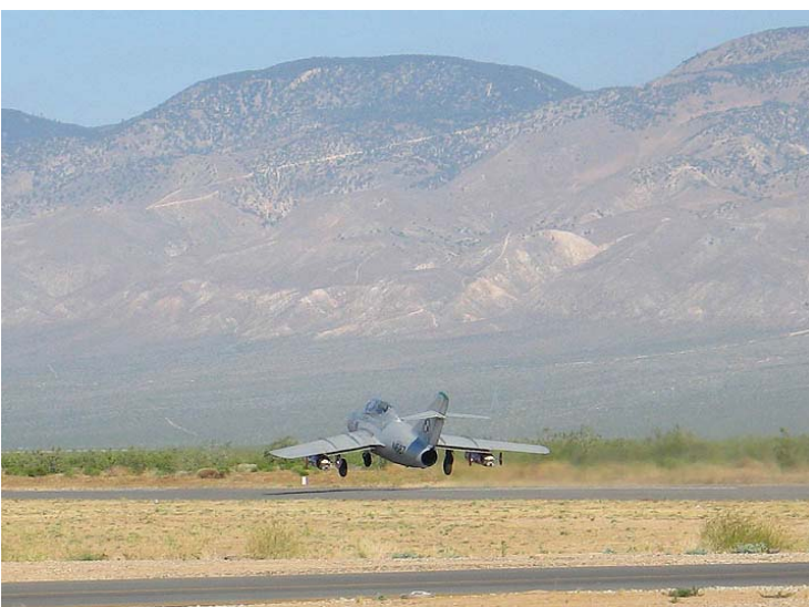
CJ and the MiG lift off for a test flight, a canister under each wing.