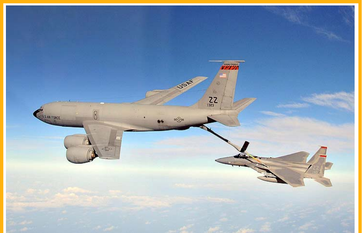
A modern KC-135R refueling an F-15. The Stratotanker fleet has been well maintained and continually upgraded over the decades.

Tankers three and four offloaded the last of their fuel, so now there were just Tom's plane, eight fighters, and the general's transport. This general now radioed to Tom that there were thunderstorms at Guam, and that Tom needed to top off each of the F-4s with 8,000 pounds of fuel to make it there.