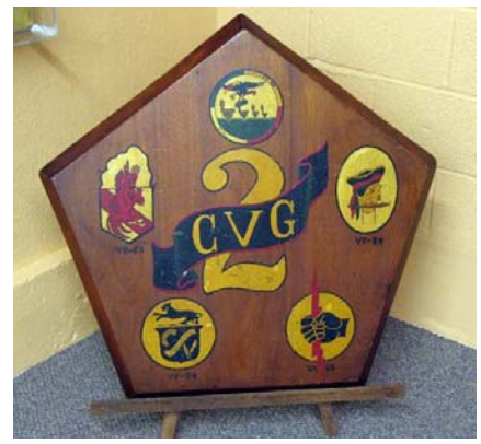
The plaque, yellowed with age, is on display in the PCAM exhibits room.

They occupied one of the poker tables in their 42-man bunk room for a full two weeks, a disruption that not appreciated by the other men in their group. That plaque remained on the hangar deck bulkhead aboard Valley Forge until she was scrapped in