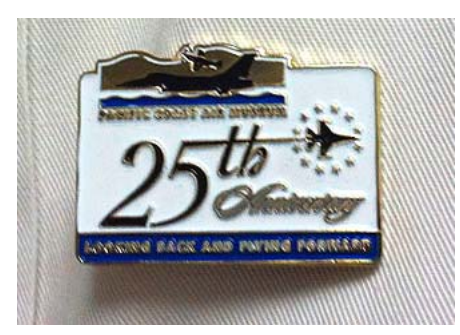
The pin is the 25th Anniversary Logo, in gold-tone, white, and blue.

Show your support for your air museum! Donate $25.00 during our 25th anniversary and receive as a