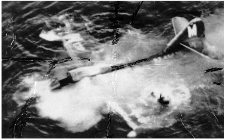
David only ever lost one plane, an F9F Panther that went over the bow of the Boxer due to a low-powered catapult. That's him in the water just aft of the left wing.]

pults that had been designed for use with slower-flying piston-engined aircraft and did not always provide enough speed to get a jet airborne. They were being launched on a raid on Pyongyang carrying six 250 pound bombs each. He was the first one catapulted but fell victim to the old catapult and settled into the water in front of the ship. The flight deck officer's solution was to take two of the bombs off each jet and keep launching. David was picked up by the ship's helicopter. A deck crewman took a picture with a Brownie box camera, and David's old and worn print is reproduced in this article.