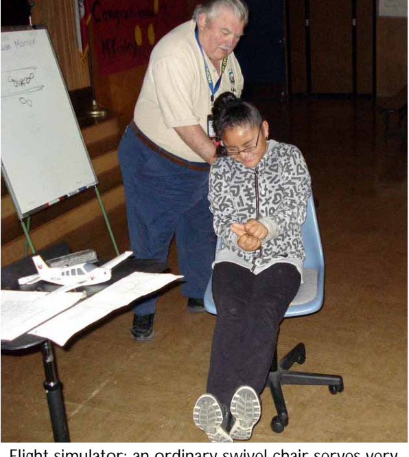
Flight simulator: an ordinary swivel chair serves very well in demonstrating the basics of flight controls.

And on May 23, 60 6th graders from Petaluma and 28 8-year-old day care students visited the museum.