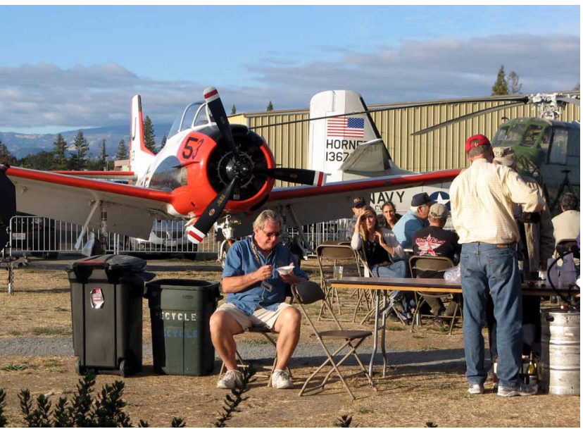
One of the greatest things about PCAM is that people can interact in, on, around, and among real aircraft, some of which are operable, but this is also a hazard. We're taking an important new look at safety issues, from top to bottom.

A staff of safety-conscious volunteers suitably trained and equipped is our first line of defense at preventing accidents. As a result of recent discussions, PCAM is launching a program to comply with SB-198 (California's Cal- OSHA Program) and also to build up