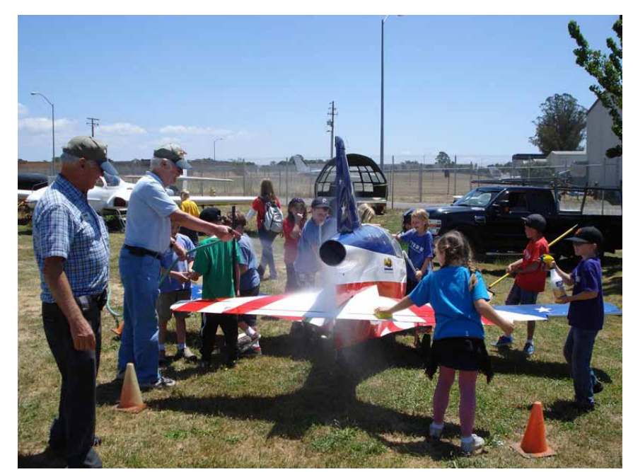
A group of eight-year-olds helped wash a couple of our planes after enjoying lunch under the wing of the F-15 and checking out the Huey.

Also in May, a group of eight-year-olds from the Solairus Day Care Center spent part of their day on the PCAM grounds, having lunch under the wing of the F-15 and exploring the Huey. And because it was National Service Day, they later helped wash the T-37 Tweet and the BD5-J.