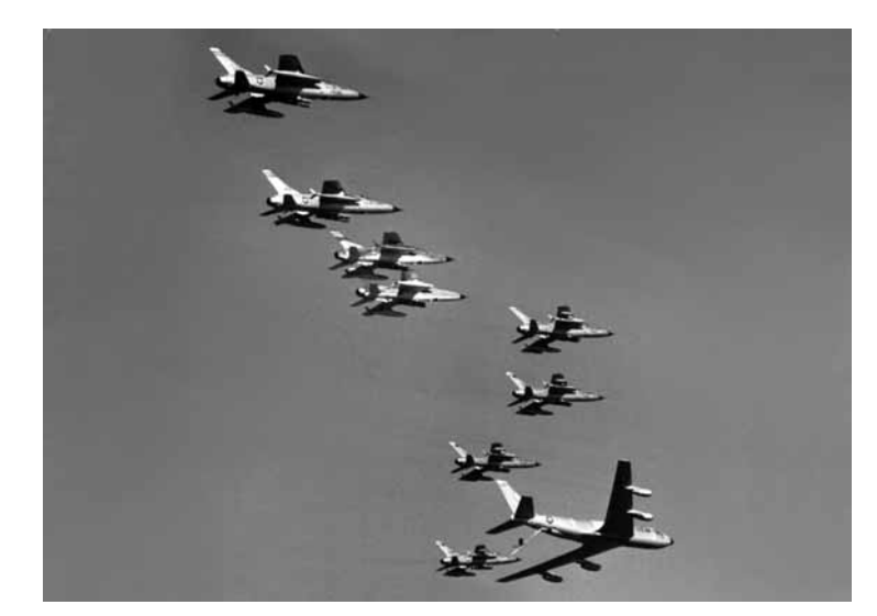
A KC-135 refueling F-105s over Vietnam

They were shocked at the losses. The B-52s had seemed invulnerable, and this heralded a frightening