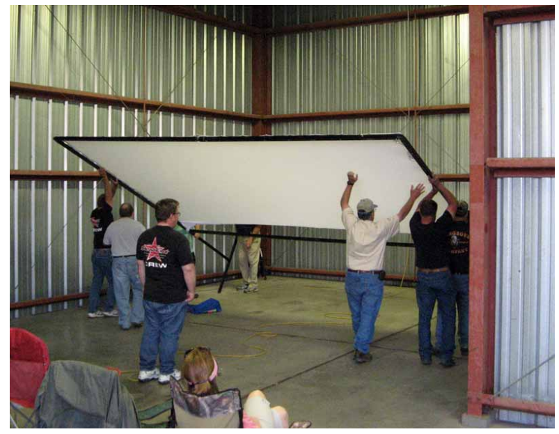
Above: the crew had to move the custom-built PCAM Cinema Screen into a nearby T-hanger because of the wind. It looks like a square sail from a clipper ship, and probably would have functioned as one had we remained outside. The hangar was actually very comfortable.

We're pleased to announce the success of the May Movie Night, when we screened "Memphis Belle." Because of the wind we had to move into a nearby T-hangar , which turned out to be a cozy and very appropriate venue! 😒