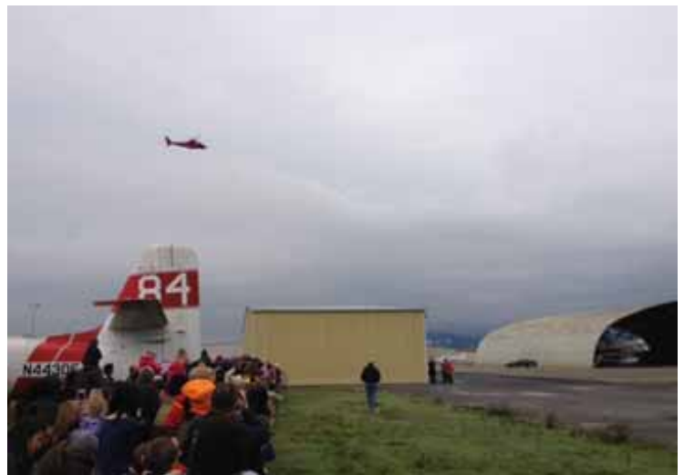
"There he is!" Marginal VFR conditions did not dissuade Santa's pilots, as they brought him in low over the Butler Hangar and landed nearby. The crowd went wild.