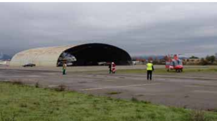
There's no mistaking the Jolly Old Elf, even from 100 yards away. The REACH helicopter departed immediately, ready to serve Sonoma County's emergency transportation needs.

would not be the same if I were hiding behind a windscreen," Santa remarked. "The sleigh lends a certain cachet. And in case you had not noticed, the sleigh-reindeer combo is magic. Gets me anywhere in the twinkling of an eye. Those REACH helicopters perform an altogether different kind of miracle every day, but for me, the sleigh's the thing. And besides, reindeer pretty much take care of themselves. At today's costs for turbine fuel that's a serious consideration, ho ho ho."