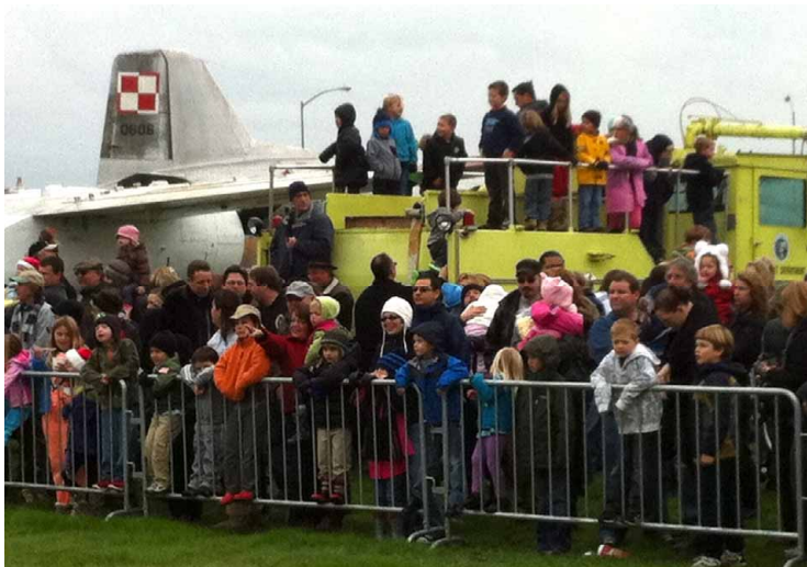
An eager crowd lined the fences. A lucky few got choice viewing spots on the fire engine graciously provided by the Rincon Valley Fire Department.

The big red chopper roared in for a landing. It settled