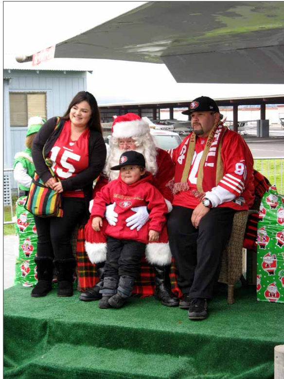
And here's what it's all about: smiles all around and a bit of holiday cheer.

Santa later denied rumors that he was going to permanently trade in his open-cockpit sleigh for a cushy REACH helicopter, citing tradition as a prime motivator. "A painting of me on the side of a coffee cup just