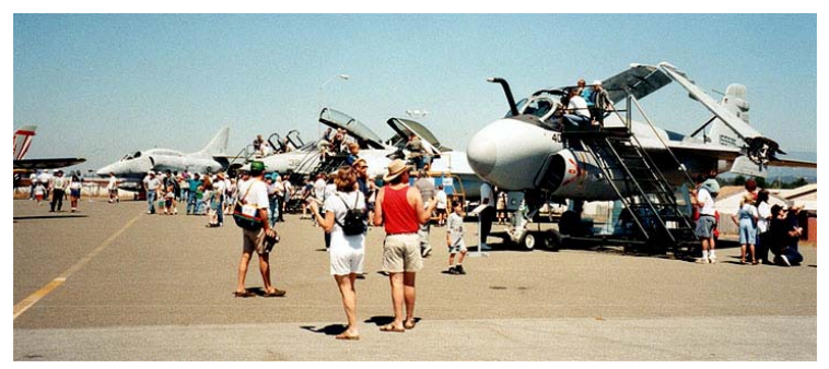
The 1996 PCAM Open House started to look like a real air show. The star attraction was a Navy F/A-18. Above is our row of climb-aboards. By now we had added the A-4E Skyhawk, F-14A Tomcat, F-16N Viper, A-6E Intruder, and several others.