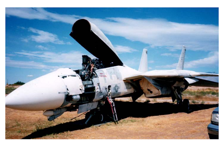
This F-14 was well on its way to the scrap heap before anyone realized it is actually a MiG Killer. Efforts are now under way to piece it back together, though not by PCAM.

PCAM personnel are well-connected within the military aviation community. This is very helpful because the distribution of aircraft to museums is often based more upon personal relationships than on a museum's position on a waiting list. Successful and high-profile restorations like the Intruder also help, as they inspire confidence that any aircraft we receive will be well