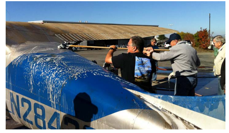
(Top) A good scrub revealed paint in very good condition.(Below) N numbers appeared on the upper surface of the wing.