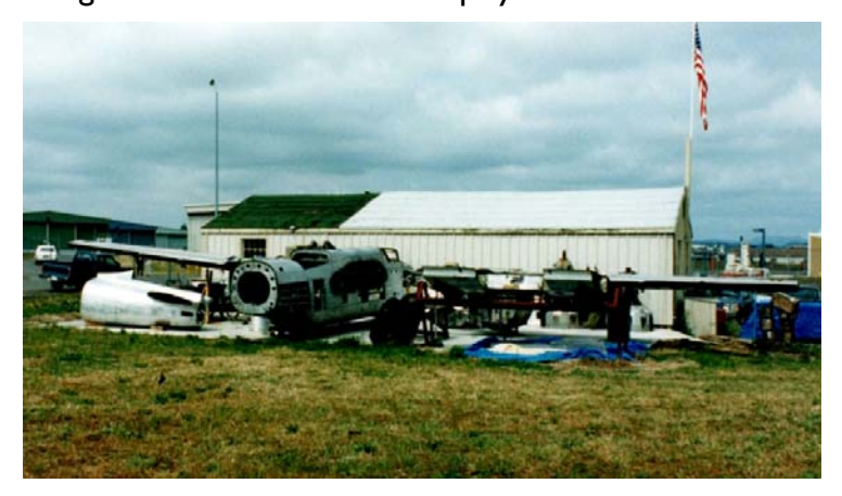
The A-26, still in pieces in the early days. It was PCAM's first plane.

The first aircraft restoration project the fledgling PCAM took on was the A-26 "Spirit of Santa Rosa." They had intended to restore her to flying condition but it became apparent that would be too expensive, so she's bring restored to fine static display condition.