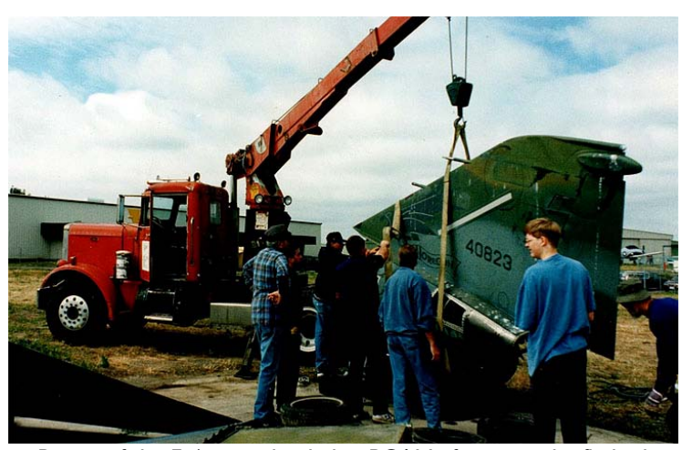
Pieces of the F-4 are unloaded at PCAM after a trip by flatbed from the eastern side of the Sierras.

The F-4 was completed just in time for the 1995 Open House. Other attractions included fly-bys, two Top Gun Aggressor Squadron F/A-18 Hornets from Miramar, and the premier of our own F-4C, F-16N, F-14A and F-8C Crusader. Other open houses over the years show-cased our growing collection of aircraft. In 1997 Amelia