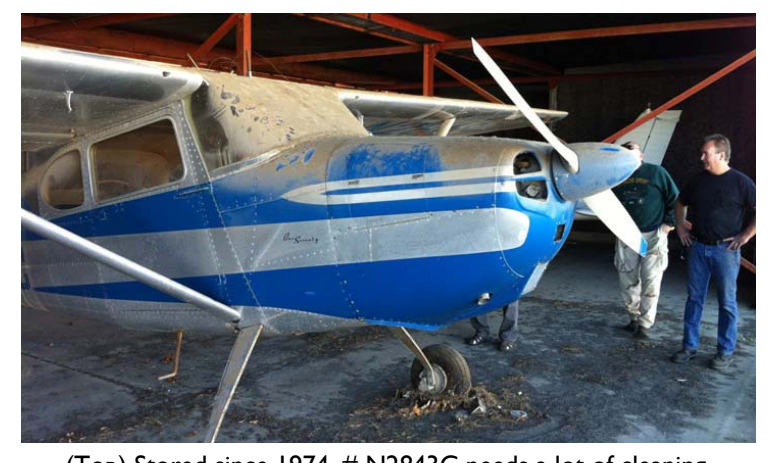
(Top) Stored since 1974, # N2843C needs a lot of cleaning. (Below) At the wash rack on November 23, ready for a bath.