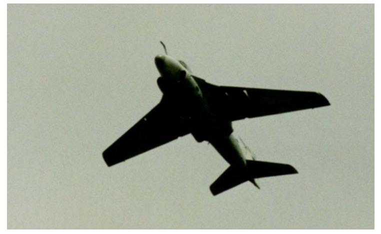
Our A-6E Intruder flies overhead on its final pass before landing for the last time at the Charles M. Schulz-Sonoma County Airport in 1994. We'll have a very similar event occur very soon... See the story on the front page.