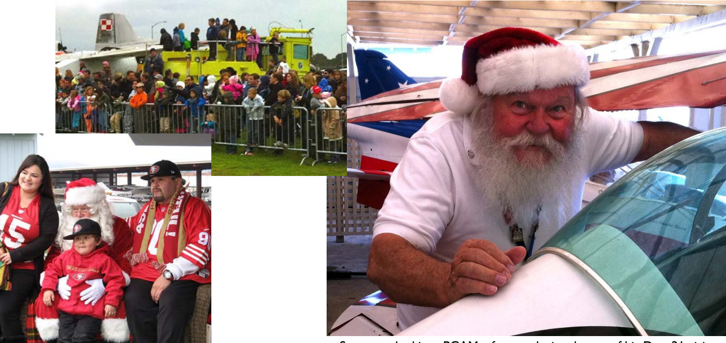
Santa sneaked into PCAM a few weeks in advance of his Dec. 21 visit, much to the surprise and delight of some visiting children. He apparently likes our aircraft, saying "Planes don't have the personality that reindeer have (and sometimes that's a good thing), but they sure are cool!"