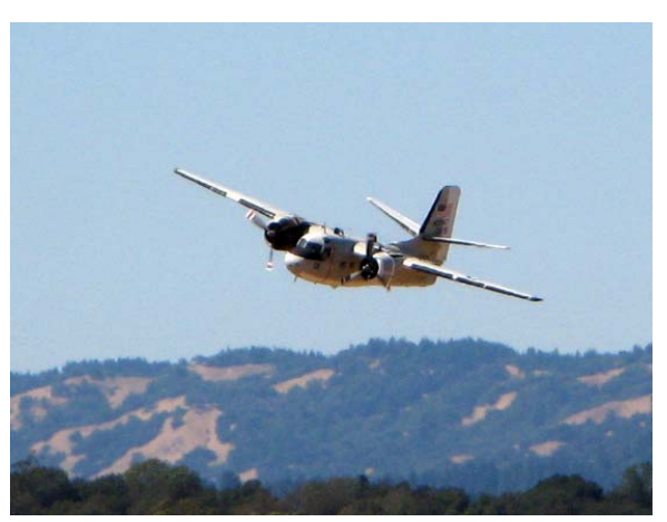
The Flight Wing is a big endeavor, as we're not flying just small civil aircraft. This is the Flight Wing's C-1 Trader, seen performing at the 2012 Wings Over Wine Country Air Show. It takes a lot of time, skill, commitment, space, and money to keep a plane like this airworthy.

crew training or to promote and support selected museum activities as directed by the museum. Pilot training is a no-brainer. The Flight Wing has very stringent requirements for pilot skill and proficiency which must be maintained. A maintenance test flight is a prudent