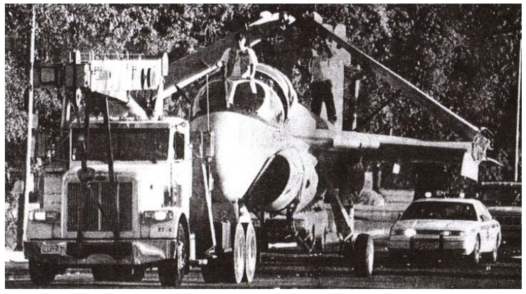
Our A-6E Intruder being towed for display at the 1995 Sonoma County Fair. See the June 2013 Straight Scoop for the full story.