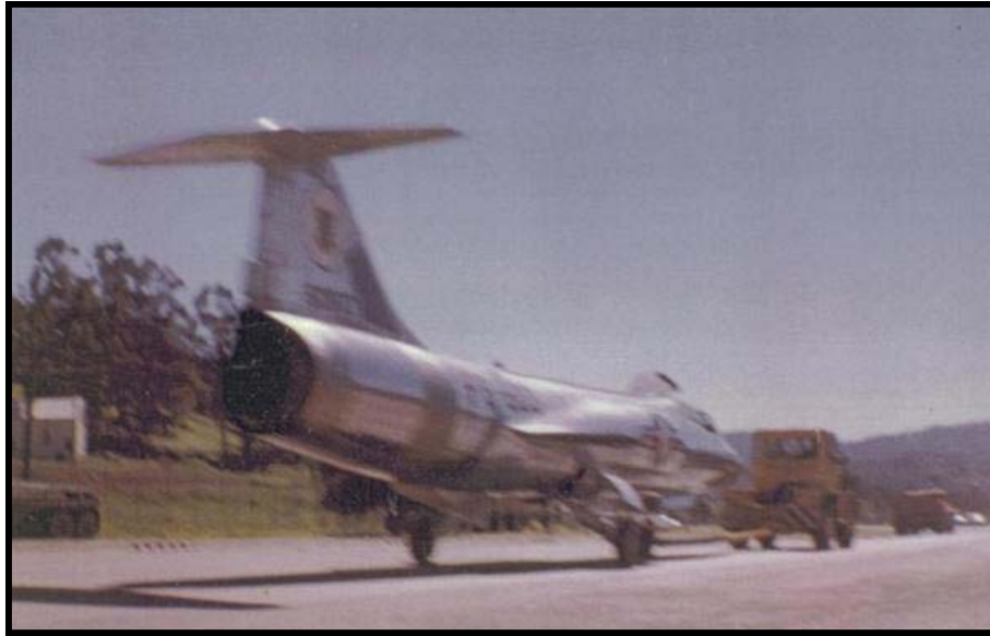
From a Hamilton AFB history blog: F-104

The puzzle of 56-769 at Cotati solved May 17, '05 2:15 AM by starfighter-781 for everyone 56-769 was on an FCF, (functional check flight ), on the faithful day of the incident. Dick Quigley was at the controls, in a burner climb.450kts to .9 Mach, then .9 to altitude. At FL 220, he picked up .9 Mach, and pushed the nose over to hold it. There was a washer laying on the bottom of the oil tank, that was inadvertently dropped in there at an earlier time. Could have been done at the factory, or anywhere between there and the flight line. When the plane was pushed over, the washer floated up due to the negative "G" force, and was sucked into the oil pump, causing the pump drive shaft to shear. He lost oil pressure at FL 290, and was over NAS Santa Rosa airport's 7,000 ft runway, so he put it in there, T.O. flaps, and 210kts over the fence. He shut the engine down at touch down and had the plane towed off the runway. We later towed it back to Hamilton via the highway.