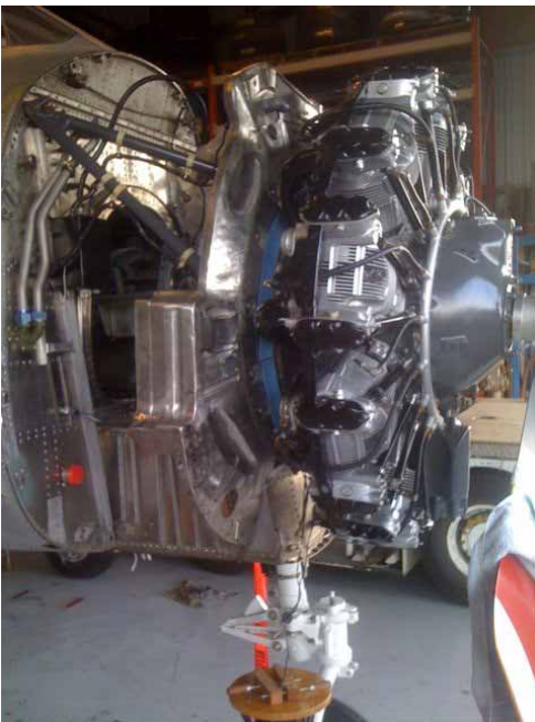
The Wright Cyclone gleams on the T-28's engine mount. The day is approaching when it will power this plane for its first flight in years.