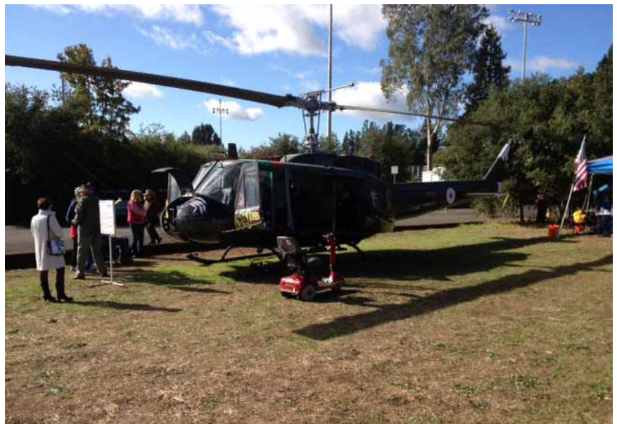
The museum's Huey was a suiting addition to this tribute to Veterans of Vietnam and other conflicts.

The Huey was a popular display, and was the catalyst for many conversations and stories. PCAM was very pleased at this opportunity to contribute to such an event.