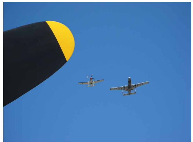
The P-51/A-10 Heritage Flight passes over a P-40 Warhawk on static display.