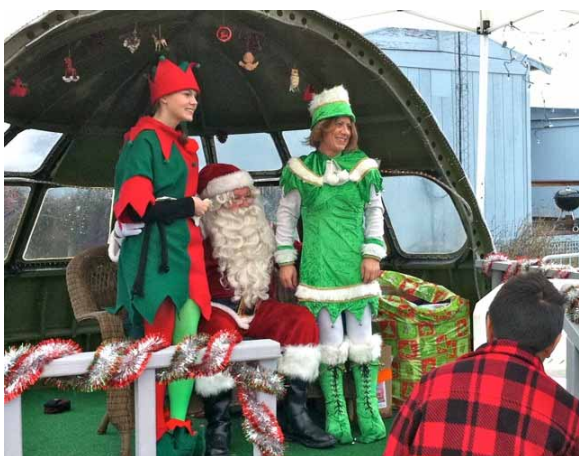
During a previous visit, the Jolly Old Elf prepares to take requests from young hopefuls as a couple of his Elves stand by for crowd control.

Santa Claus will arrive at the Pacific Coast Air Museum a little early, on December 15! And he's traded in reindeerpower for horsepower, leaving his sleigh back at the North Pole and arriving instead in a special 21st Century sled. Thanks to the folks at REACH Air Medical Services, Santa will be flown to the PCAM Landing Zone by helicopter! After Santa arrives around 10:30 he will set up shop on a stage by the F-15 with his bag of treats and will take requests from all kids. Every child will get a free bag of goodies. While the kids wait to see Santa they can get their faces painted and play in the jumpies.