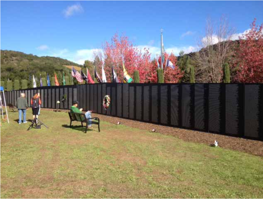
The Traveling Vietnam Wall is an 80% replica of the Vietnam Veterans Memorial in Washington DC, containing all 58,000+ names on the original.

On November 7 through 11, the Traveling Wall was in Sonoma as part of the Cost of Freedom Tribute put on by VFW Post 1943. PCAM had the honor of providing our Huey helicopter for display.