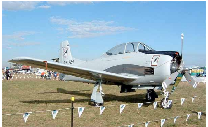
The museum's T-28C Trojan is headed back to the skies with the help of a dedicated crew of volunteers.

For years the museum staff has been working diligently on the restoration of the museum's T-28C to flying condition. We've been very active with this project and the progress is substantial. The quality of work being done by this team is thorough and of the highest quality standards. Every member of the restoration team is proud of what they have accomplished. They will also tell you that such a project takes time and money. At their current rate it won't be long before the engine will be running and the aircraft is ready to be flown. It is also important to state that nothing related to future aircraft acquisitions should have any effect on the T-28 progress. All volunteer and financial support required for future acquisitions will be in addition to the current T-28 project.