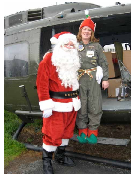
Santa and one of his Elfish flight crew

This event is free, the Museum's gift to the community. So you don't have to wait in a really long line we will give every child a numbered ticket. We will use our PA system to call 25 ticket holders at a time to line up for Santa. Pick up your ticket in the Gift Shop as you arrive.