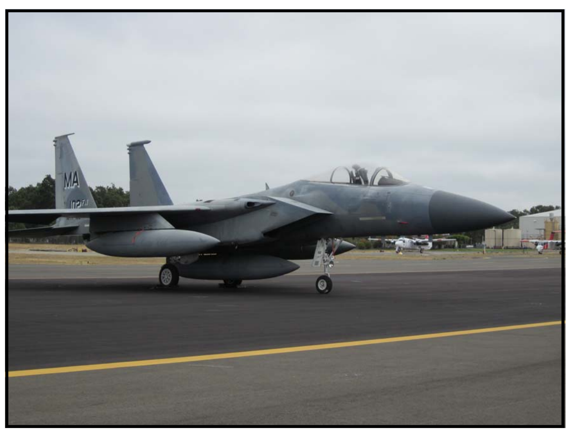
Remembering 9/11—- Words are not necessary—- Never Forget!

To promote the acquisition, restoration, safe operation and display of historical aircraft, preserve aviation history and provide an educational venue for the community