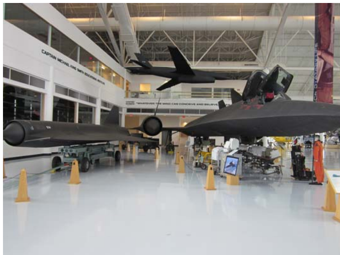
Pacific Coast Air Museum