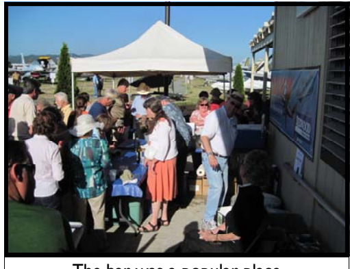
The bar was a popular place