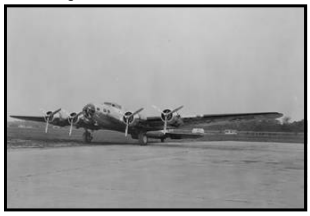
B-17C S/N 40-2049