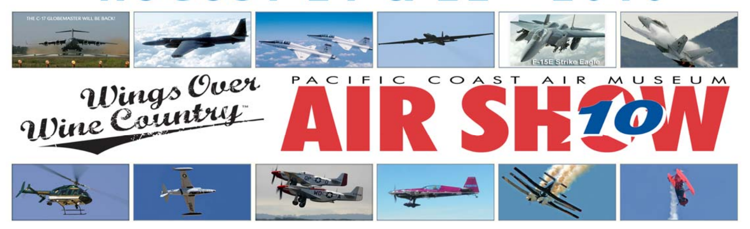
Our August 21-22, 2010 Air Show will be the best one we've ever had: