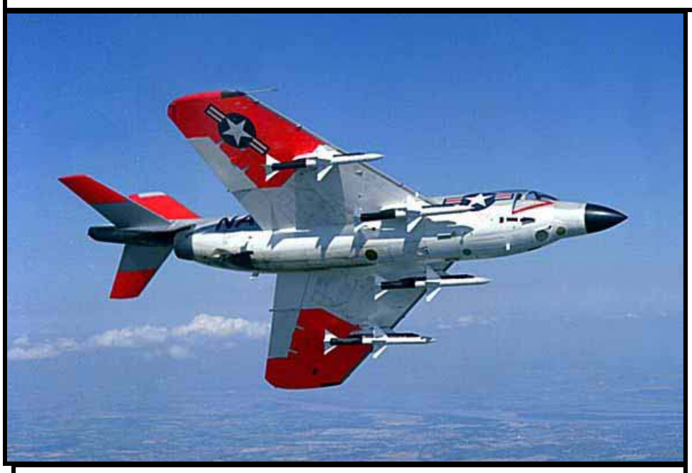
Can you name this aircraft? Answer at bottom of page #11