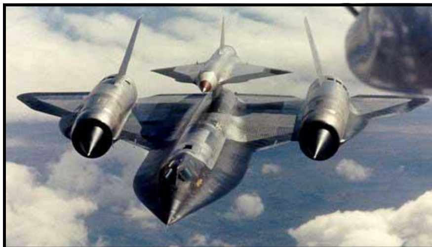
Lockheed D-21 Tagboard Drone on M-21