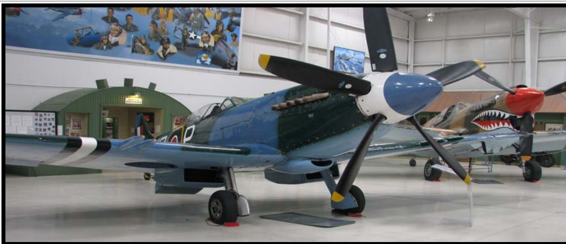
Spitfire and P-40 at the Palm Springs Air Museum