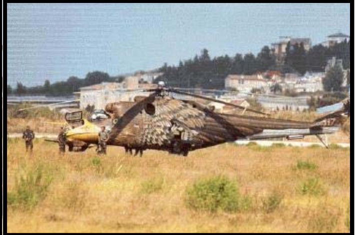
This MI-5 Helicopter was recently & reportedly photographed in Afghanistan and was being flown by Hungarian Air Force units. What a neat paint job.