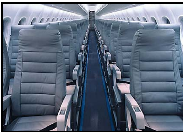
Horizon Air Q400 Exterior and Interior