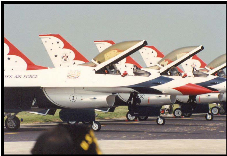
U.S. Air Force Thunderbirds