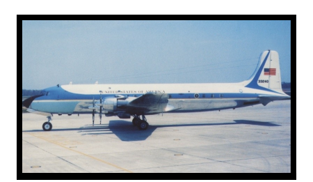
U.S. Air Force VC-118 "Independence"