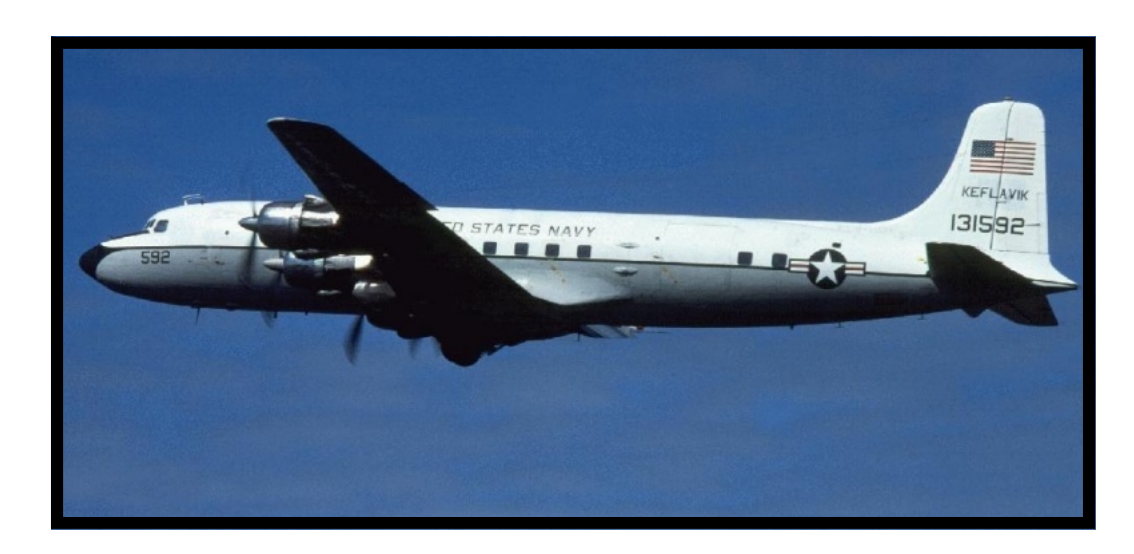
U.S. Navy R6D