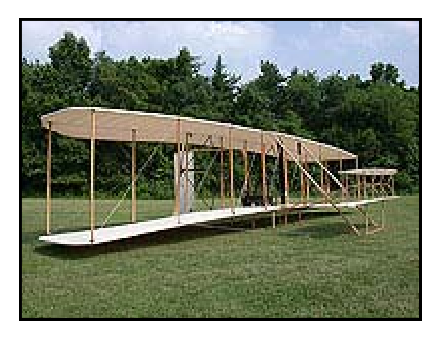
1903 Wright Flyer

Our June 21st program features interviews with pilots, engineers and military scholars and includes footage from World Wars I and II and is a definitive history of U. S. Air Force combat from the Wright Brothers through WWII.