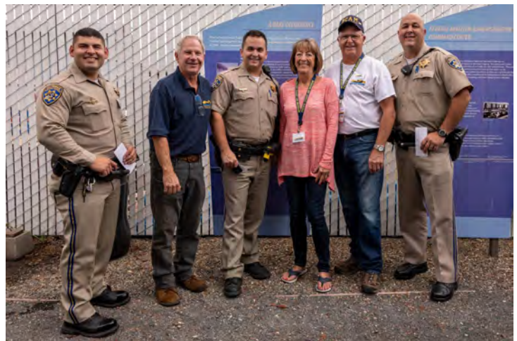
Our local California Highway Patrol— Thank you for your service!