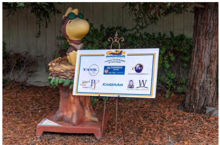
A Special Thank You to Sponsors of our Last Hotdog Thursday of 2018