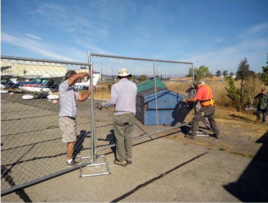
Putting up the New Fencing 2018

The new fencing is up and nearly complete (a swing gate is being fabricated and should be installed by the time you read this).