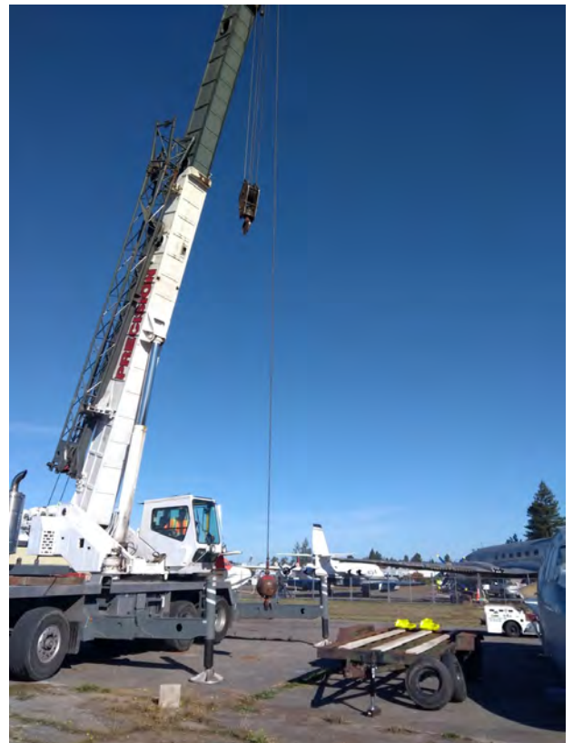
Precision Crane at work on the DC-6 Nose

We will continue to operate from the existing Gift Shop and Annex for the time being. We are looking to engage an architect for detailed plans. Once we have a basic plan, it will be submitted to STS Airport Management for review and approval, then we can request bids and permits. We would like to say Thank You to all of our members who made this possible – Preparing the Butler hangar for the move started back in February, in preparation for the Gary Sinise concert. Just cleaning it out was a big effort. Then, as part of the Wings Over Wine Country Airshow, the tug and aircraft crews moved the airplanes back into the new site, using a plan developed over the last few months. Finally, much additional work has been accomplished to move the odds and ends.