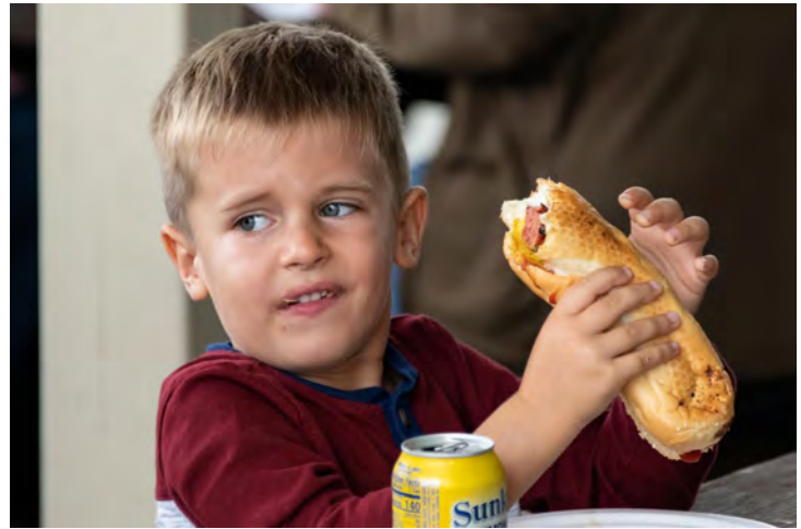
His hotdog is almost as big as he is!

The 2019 dates: April 4, May 2, June 6, July 11, August 1, September 5 & October 3