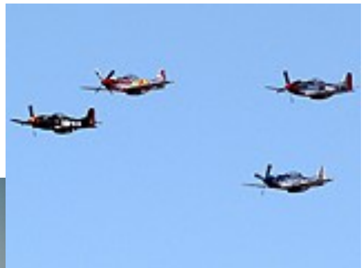
Look toward the sky to see Fly-bys of historic WWII aircraft.