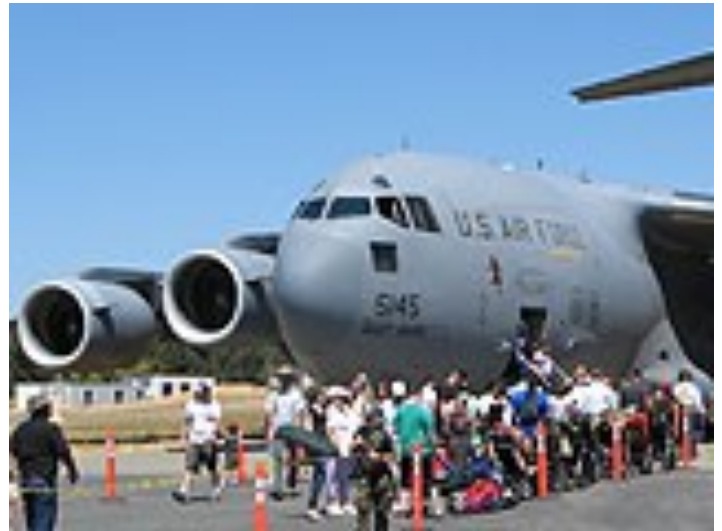
Take a walk through the C-17 Globemaster III