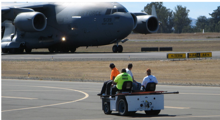
Wings Over Wine Country Volunteers

Great jobs at the Air Show are still available. Check out what is needed and sign up here!