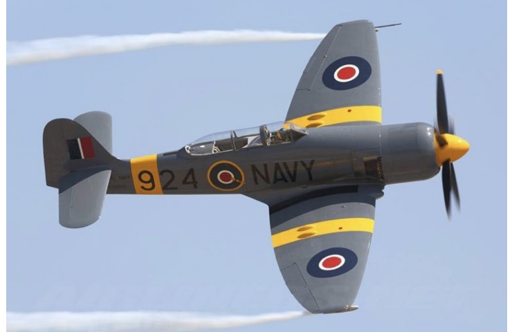
Sanders Smoke Show