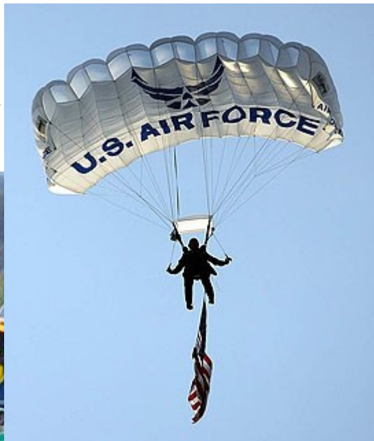
United States Air Force Academy Wings of Blue Skydiving Team