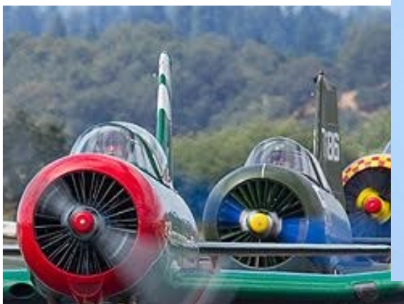
The Red Stars

In addition to honoring our community’s First Responders, the 2018 Wings Over Wine Country Air Show will offer exciting performances by a variety of aircraft and performers including: