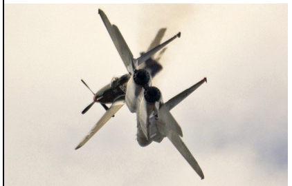
Heritage Fly-by—2004 PCAM