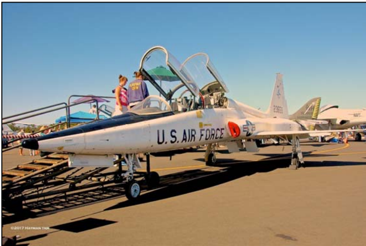
Two young visitors inspecting our well preserved T-38 Talon

Each month we schedule an open-cockpit weekend where several of our display aircraft cockpits are opened up for viewing. With the viewing stand placed beside the fuselage visitors can get a direct view into the actual cockpit and instruments of a historical airplane. These events have been very popular and are not normally conducted by very many other museums.