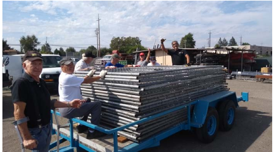
The temporary construction fencing on site now ready for installation.

-- C J Stephens President, Pacific Coast Air Museum