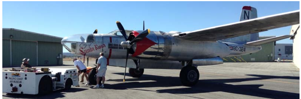
Above: The A-26 being prepared for display the morning of September 23, for Museum Day Live!

We are now also working with Children's Museum of Sonoma County to widen our reach within the community. By working together we will be able to combine the results, giving us wider contact with our client base and raising awareness.