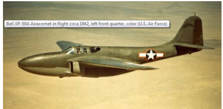
One of the three XP-59 prototypes in flight over the California Desert in 1942.

( https://www.thisdayinaviation.com/page/6/ )