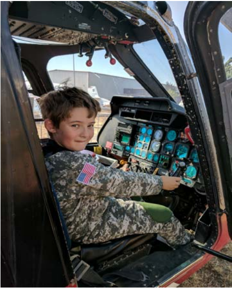
A future pilot gains experience at the controls of our REACH helicopter during Smithsonian magazine’s Museum Day Live.

We plan to participate in Museum Day Live again next year, and hope to get 100 visitors. It’s a great opportunity to spread awareness about the Museum and to bring in visitors who might otherwise never come out to see us. ★