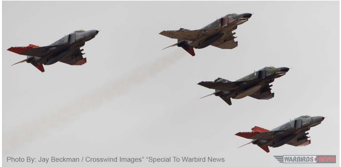
The last Phantoms make one of the last passes of a long and illustrious career. This photo was shot at the retirement ceremony at Holloman AFB, December 21, 2016. Used by permission.

The Phantom was a large fighter with a top speed of over Mach 2.2 and could carry more than 18,000 pounds of weapons on nine external hardpoints, including air-to-air missiles, air-to-ground missiles, and various bombs. During the Vietnam War, the F-4 served as the principal air superiority fighter for both the Navy and Air Force, becoming important in ground attack and aerial reconnaissance roles late in the war. It remained in reconnaissance use by the U.S. as Wild Weasels (Suppression of Enemy Air Defenses) in the 1991 Gulf War, finally leaving front-line service in 1996. F-4s were also operated by the armed forces of 11 other nations. Israeli Phantoms saw extensive combat in several Arab-Israeli conflicts, while Iran used its large fleet of Phantoms in the Iran-Iraq War. 100 or so F-4s are still in service with Japan, Greece, Turkey, Iran and South Korea.