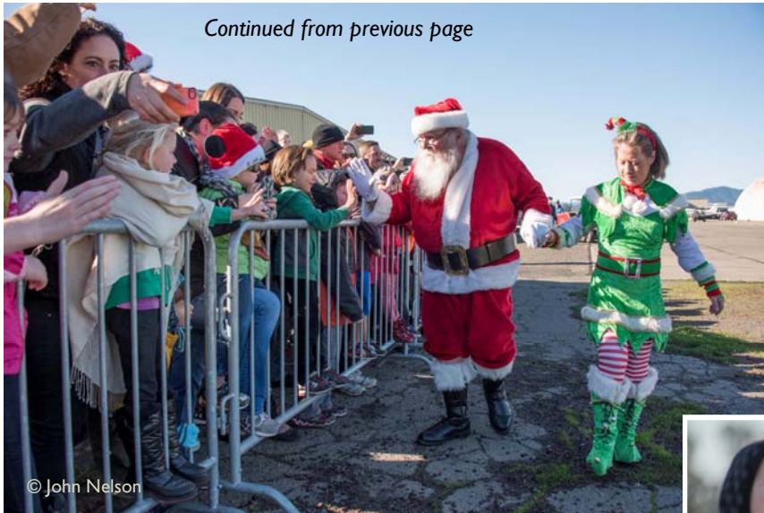
Continued from previous page