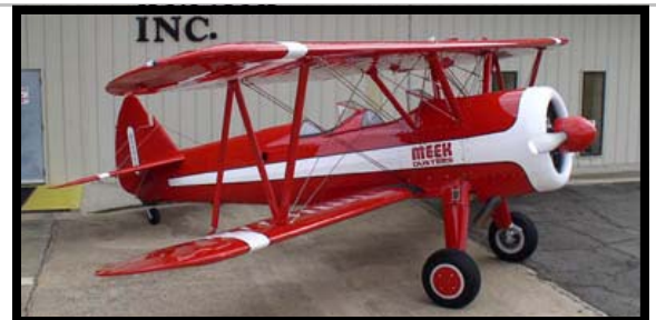
The Stearman PT-17