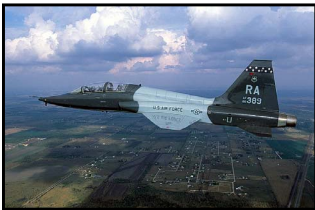
A T-38 from USAF Randolph AFB Texas

Besides the USAF, USN and NASA, other T-38 operators include the German Luftwaffe , the Portuguese Air Force , the Republic of China Air Force , and the Turkish Air Force .