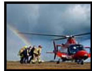
REACH Crews in action

The Staff and membership of the Pacific Coast Air Museum appreciates all that REACH does for Sonoma County and the State of California.