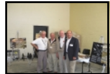
PCAM Staff at Homeless Shelter Dedication