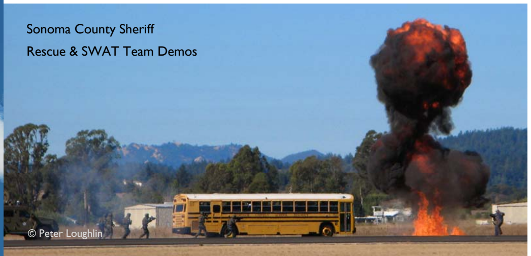
Sonoma County Sheriff Rescue & SWAT Team Demos