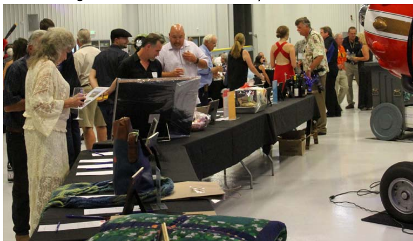
Below: Gala guests examine some of the many auction items.

We also owe special thanks to the hosts of the