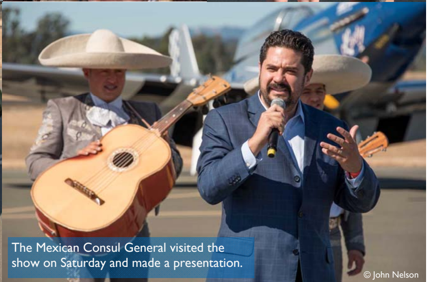
The Mexican Consul General visited the show on Saturday and made a presentation.