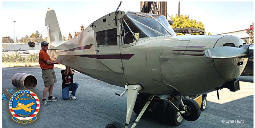
Skyranger N92828 as it got unloaded from its shipping container upon arrival at PCAM.

First, a little about the airplane. Its lineage is based on an original design in the 1930's by the Rearwin company, the same manufacturer of the Rearwin Sportster that PCAM already has in its inventory. Rearwin foresaw that the days of radial engines would come to an end and they needed a platform that accommodated the "new" horizontal opposed engine. Various designs were attempted and ultimate certification was achieved just before WWII with a 75 HP Franklin engine that had no electrical system. Rearwin sold out to Commonwealth Aircraft during WWII and the new company revived the design with an 85 HP Continental engine with an electrical system. They produced a couple hundred aircraft after the war. Commonwealth became insolvent at the end of 1946 and type certificate data has been minimal. The Skyranger N92828 that is now part of PCAM is production #24 that carries the Commonwealth name.