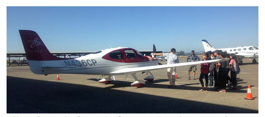
Also at Sonoma Jet Center, this Cirrus served as a demonstrator for aero-dynamics and flying in general.

workplace while observing demonstrations and participating in hands-on activities. As a result, students can better organize their thoughts, solve problems through logical reasoning, and draw connections between the importance of studying algebra and the possibilities of future careers.