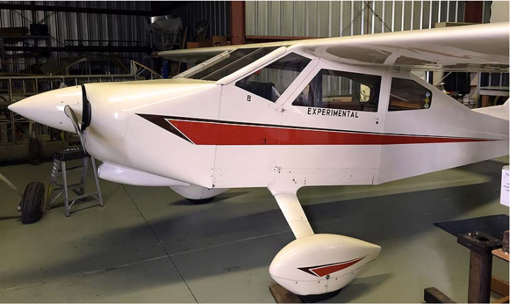
The Bede-4 in the Flight Wing hangar.

Bob built the BD-4 and flew it for over 1100 hours before donating it to PCAM. Having a homebuilt in an air mu-