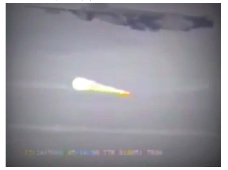
This poor quality image from a low-resolution video shows the laydown delivery of a practice version of a B-83 nuclear bomb, called a "shape." The B-52 that dropped it is at the top. The orange spot in the middle is the bomb itself. The yellow wedge behind it is the shroud lines, and the white bulge at left is the opening parachute canopy. It was dropped from about 500 feet.

shape falls out. Instantly, a tiny parachute pops open, which pulls out a larger parachute that opens just in time to float the shape to the ground. It takes only a few seconds.