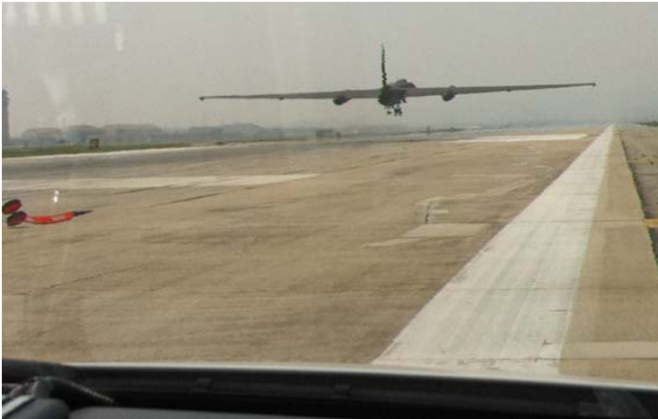
Christina shot this photo from the chase car. You can see one of the drop-off pogo wheels bouncing along the runway at left.

Because of the cockpit's design and the astronaut-style pressure suit the pilot must wear, U-2 pilots can't see the runway during takeoff or landing and have to be "talked" up and down. So a second, experienced U-2 pilot drives a chase car and follows the U-2 down the runway during every takeoff and landing, acting as the pilot's eyes.