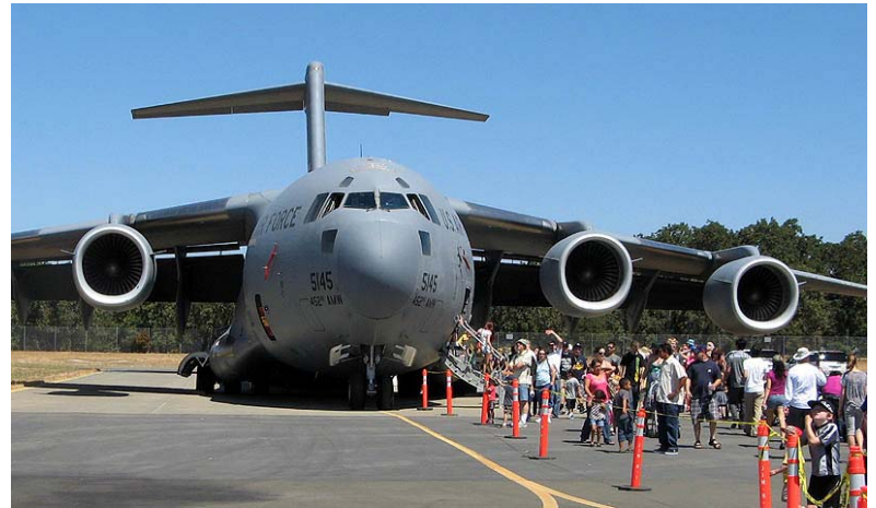
A C-17 Globemaster III will be available for walk-through tours at Wings Over Wine Country! The show takes place at the north end of the Airport this year.

With a little over 6 weeks to go until Wings over Wine Country 2015, final plans are beginning to come together. With the ever changing environment at the airport there are several big changes from the prior year's site. Most importantly, the show will be back on the north end of the airport. Our new main entrance will be located at the car gate next to the Kaiser Air lobby building. As guests enter the show they will walk past the parked Canadian Forces Snowbirds planes before entering the main show site. The main VIP area has been moved slightly to the north to accommodate airport construction. PCAM aircraft will be clustered around the new self-serve fuel island. The "hot pit" has been moved to the Sonoma Jet Center ramp which will free up a lot of space and allow a lot of viewing area for the crowd all the way north to the C-17. While these are major changes from the North Ramp layout of prior years, there will still be ample room for a comfortable and enjoyable guest experience.