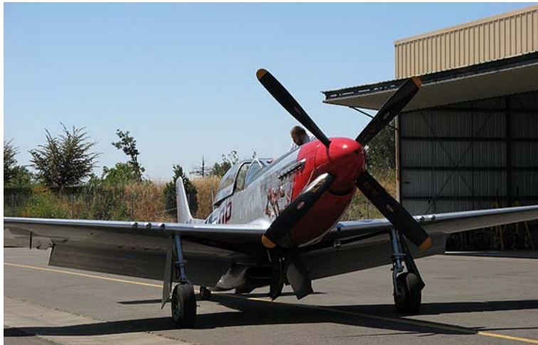
Red Dog before the flight. Dana Hunt is cleaning the windshield.

propeller suddenly started turning faster. Then there was a cloud of blue smoke and the engine was roaring and the propeller was spinning and the whole plane was vibrating and I smelled a lot of burnt aviation fuel.