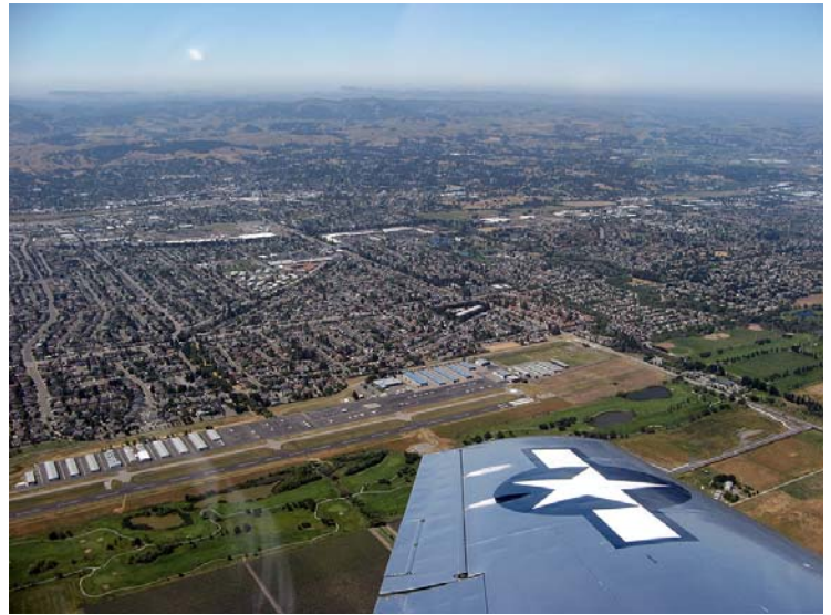
The Petaluma airport