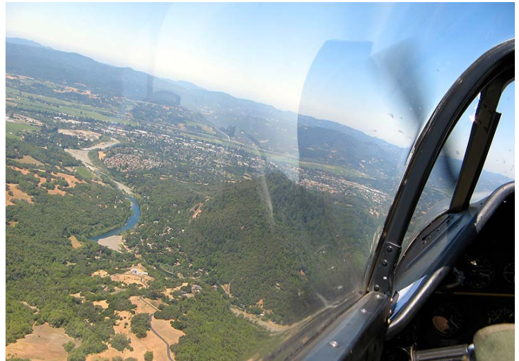
Fitch Mountain (center) in Healdsburg.