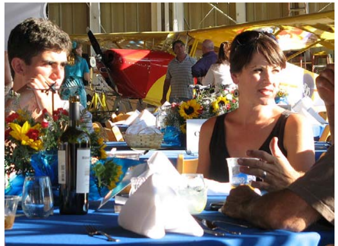
Mingle with performers and friends at the 2015 Performers's Reception, Friday September 25, from 6:00 through 9:00. Advance ticket purchase required.

On the evening before the Air Show, join the Canadian Forces Snowbirds team, USAF F-16 Fighting Falcon crew, C-17 crew, USAF Wings of Blue Skydivers, and warbird and aerobatic pilots for an evening in the historic Redwood Hangar at Sonoma Jet Center. Celebrate the 70th anniversary of the end of World War II with a 1940s swing dance theme. A buffet dinner, cocktails, and a silent auction fundraiser will make the evening complete. Dress is casual to dressy, and the decor can't be beat - the interior of a working aircraft hangar to create the perfect atmosphere for a vintage Air Show event! Tickets are available online through the Air Show website, and must be purchased in advance: $65.00 each, or a whole table of 8 for $500. Does not include Air Show admission. Questions? Phone 707-575-7900.