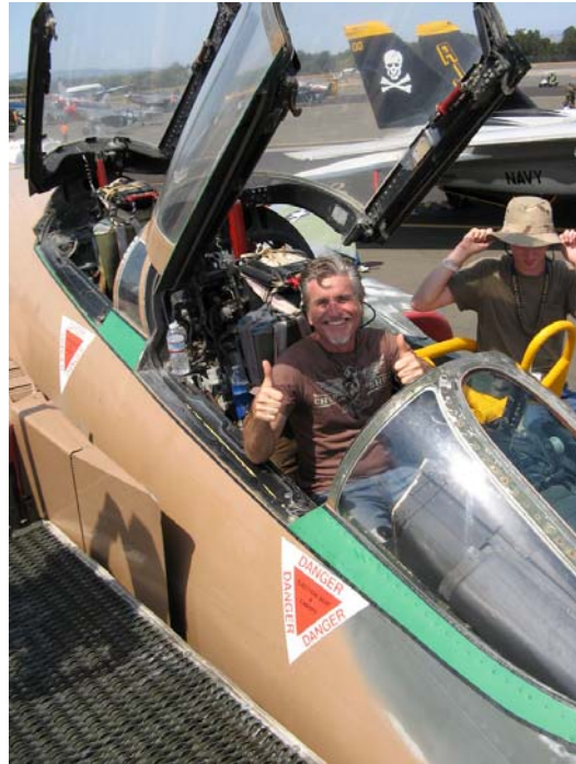
Hundreds, and maybe thousands, of people have sat in the cockpit of F-4C serial #64-823 over the years, never realizing they were sitting in a true piece of history.