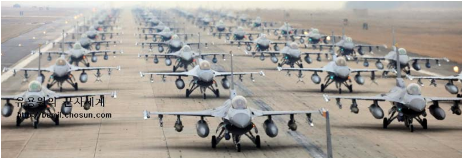
Sixty F-16s on the runway at Kunsan. North Korea likes to display its military might through flashy parades with thousands of soldiers marching in unison, and fake nuclear missiles on obsolete mobile launchers. Our parades are somewhat different.