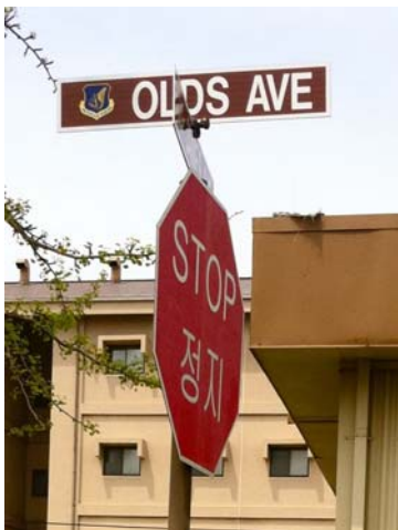
Left: One of the new Olds Avenue signs at Kunsan

Why the renaming? Robin Olds led the 8 th TFW for a year when it flew out of Thailand during the Vietnam War. For reasons too extensive to explain here, he gained legendary status and the eternal admiration of Air Force fighter pilots. He gave the 8 th its moniker, the Wolf Pack, a name they bear proudly to this day. Within the Air Force, Robin Olds is known as Wolf One. It seems the 8 th is still "all about Robin Olds," she said. They even have a Robin Olds room on base, full of memorabilia and a lot of his old stuff.