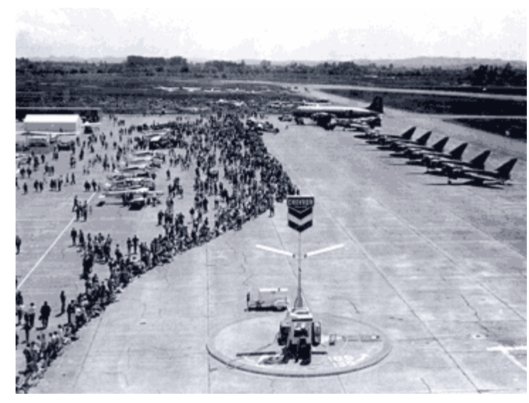
May 1967: Airport Appreciation Day, early forerunner of Wings Over Wine Country Air Show.