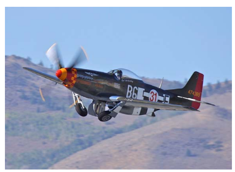
Just Added: Dan Vance Aerobatic P-51 Mustang

Get your tickets at the gate or through the Wings Over Wine Country website at <a href="https://www.wingsoverwinecountry.org">www.wingsoverwinecountry.org</a>. •