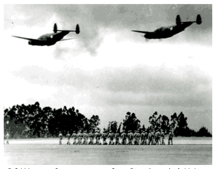
B-34 Venturas fly over troops at Santa Rosa Army Airfield during World War II.

The auction will benefit the Pacific Coast Air Museum