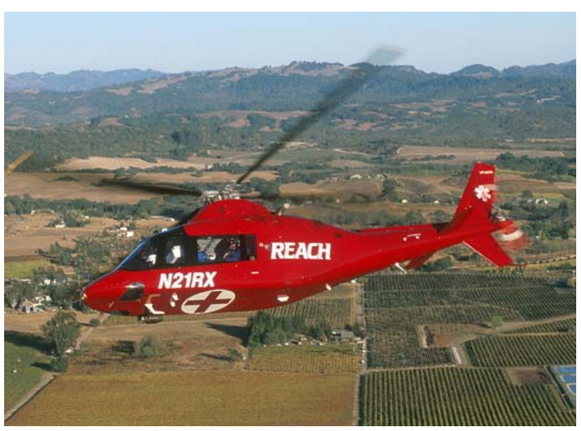
REACH Westland "Augusta" helicopters are commonly seen in the skies over Sonoma County, and are a godsend to seriously ill and injured patients. A REACH for Life membership can cover the cost of such an emergency flight, and is available to PCAM members.

In a medical emergency, every second counts, especially when transporting patients who are far away from adequate medical treatment. No one