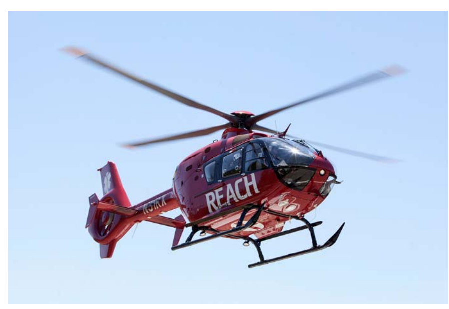
REACH has added a new Eurocopter EC135 helicopter to its fleet, operating out of their Concord, CA base. The Eurocopter adds new patient care capabilities, increased range, and other benefits.

knows that better than the flight crew at REACH Air Medical Services. REACH responds to on-scene calls, performs hospital-to-hospital transports, and assists search and rescue, carrying seriously ill or injured patients to the nearest appropriate medical facility.