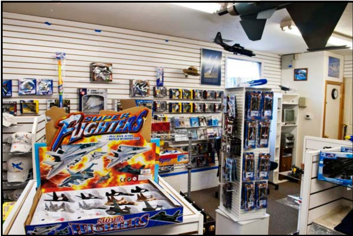
Photo is of the Pacific Coast Air Museum Gift Shop

When is the last time you came out and just walked around the museum? If you have not been there for a while, you will be greatly surprised at the changes that have taken place since your last visit. How about it? Have you been out to see our F-15 Eagle? How about the changes in the facility? Have you got a spare couple of hours on Saturday or Sunday? Come out to your museum and enjoy yourself.