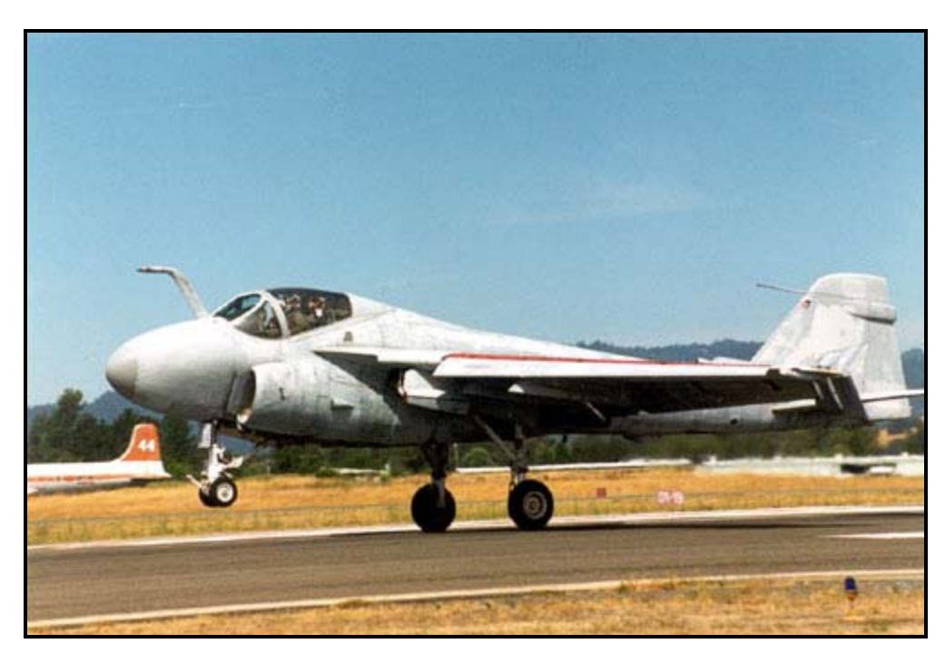
The A-6 "Intruder" is the highlight of November's "Climb Aboard" activity at the Pacific Coast Air Museum. Come out and see this legendary Navy aircraft for yourself.

To promote the acquisition, restoration, safe operation, and display of historic aircraft, preserve aviation history and provide an educational venue for the community