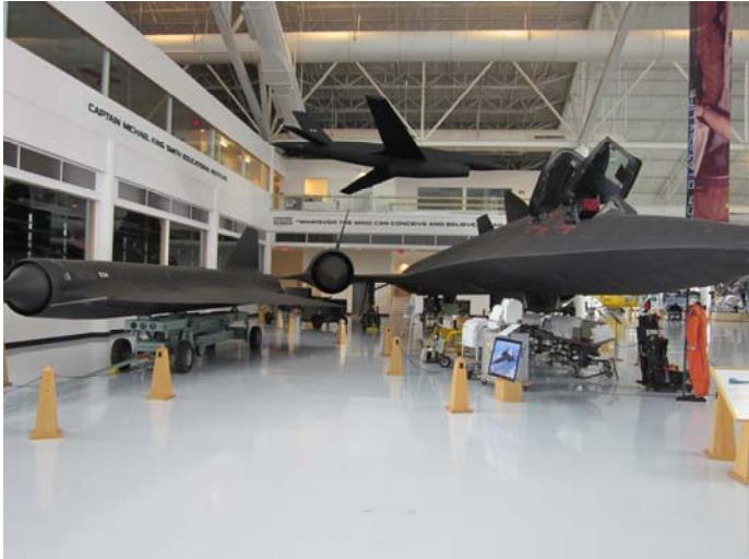
Pacific Coast Air Museum