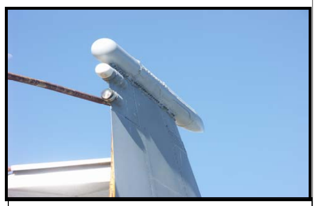
The Damage Repaired (6/21/2011)