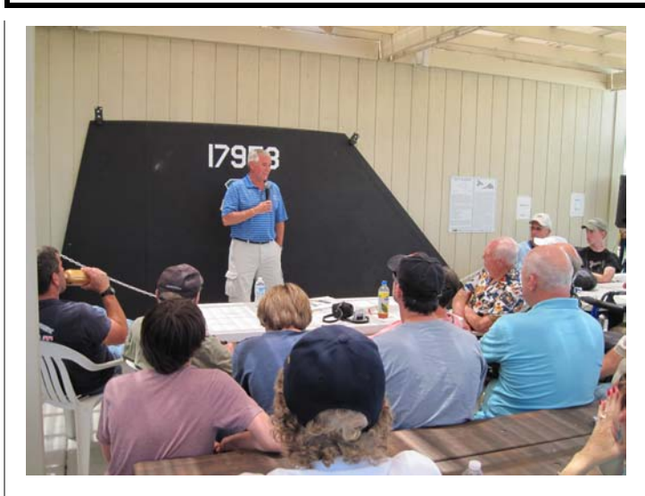
Duffy speaks to museum members and guests