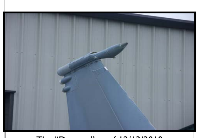
The "Damage" as of 12/13/2010