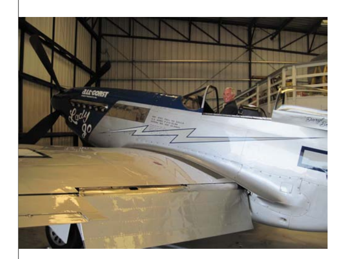
Tim says he's always wanted to fly a P-51 Mustang