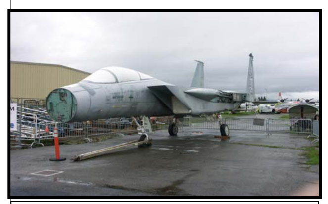
The "First Responder" as received