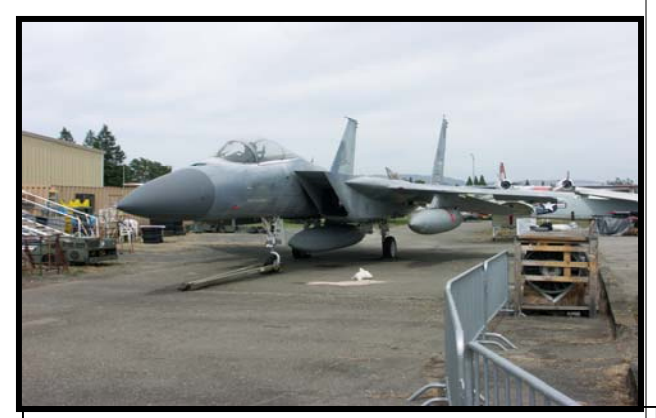
Our F-15 as of 6/21/2011, It is really looking like an airplane.