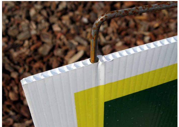
Please donate your old election campaign signs or new Coroplast, to be used as backing for next year's Air Show signs.

After the elections, please collect any corrugated plastic campaign "lawn signs" from your friends, family, and neighbors, and let Ray Smith know. He's gathering these as a means of saving money on Air Show advertising. We are going to glue next year's Air Show promotional graphics right over this year's obsolete campaign signs. Specifically, we are looking for the material in the photo below which resembles corrugated cardboard but is made of plastic. It's trade name is Coroplast®, and if you or someone you know can donate new or used Coroplast we would welcome that too. It can be of any color but must be in good condition and not bent. Contact Ray Smith, 707-837-7573, or smith-rj@comcast.net