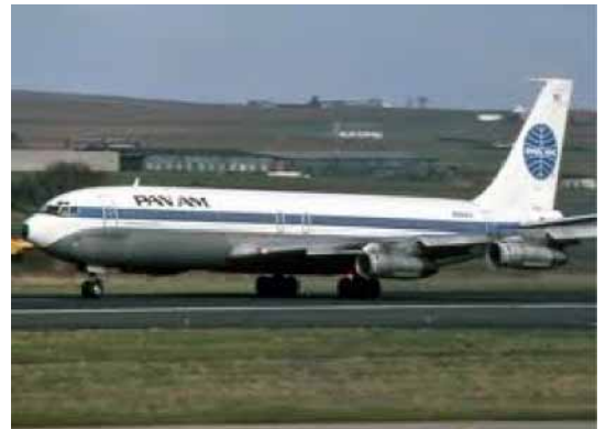
A Boeing 707 in classic Pan Am livery