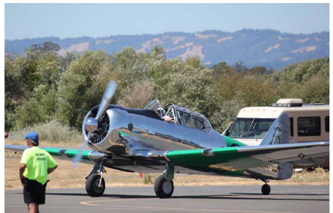
A highly polished SNJ trainer warms up on the ramp prior to its demonstration flight, August 19, 2012