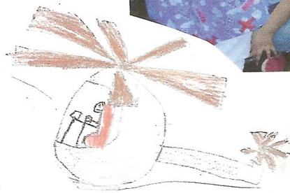
Homer, The Helicopter