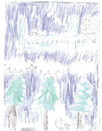
Forces of Flight