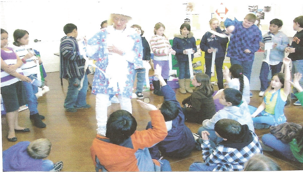
Wave Length Play (based on the Electromagnetic Spectrum)