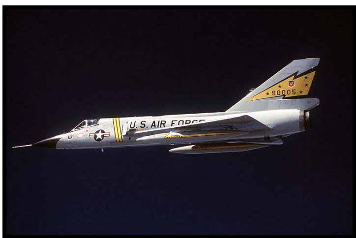
One of these aircraft is the F-102 "Delta Dagger" and the other is the F-106 "Delta Dart". Which is which?