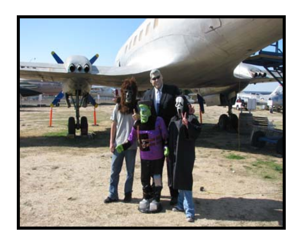
A Ghoulish Crew greets the pub-