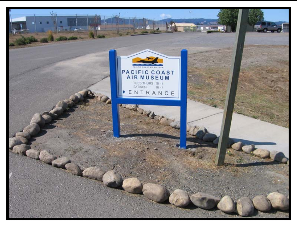
For those of you who do not get out to our museum often, this picture is of our great new sign