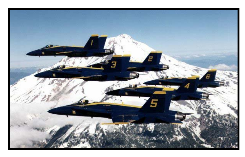
U.S. Navy "Blue Angels"

Completed ballots must be mailed or hand-delivered to arrive at the museum by December 17<sup>th</sup>. Ballots may also be delivered to the election committee at the Annual General Meeting, December 17<sup>th</sup>.