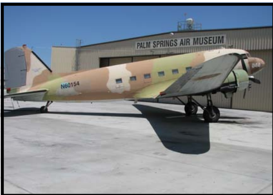
C-47 Palm Springs Air Museum