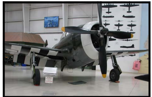
P-47 Palm Springs Air Museum