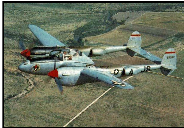
The Lockheed P-38 "Lightning"