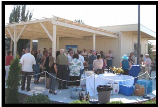
Folks enjoying the patio

Again, many thanks to Gloria Going for making this all possible. September 8th was a very special day for the Pacific Coast Air Museum.