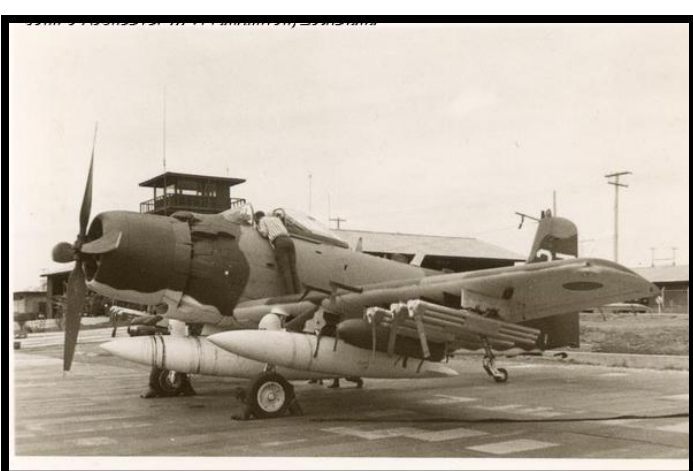
U.S. Air Force A-1E "Skyraider"