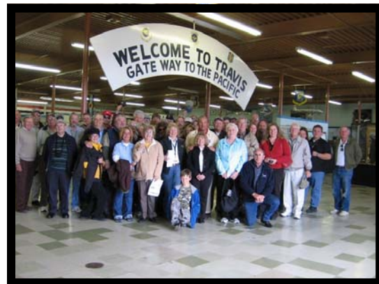
Travis Air Force Base Air Museum