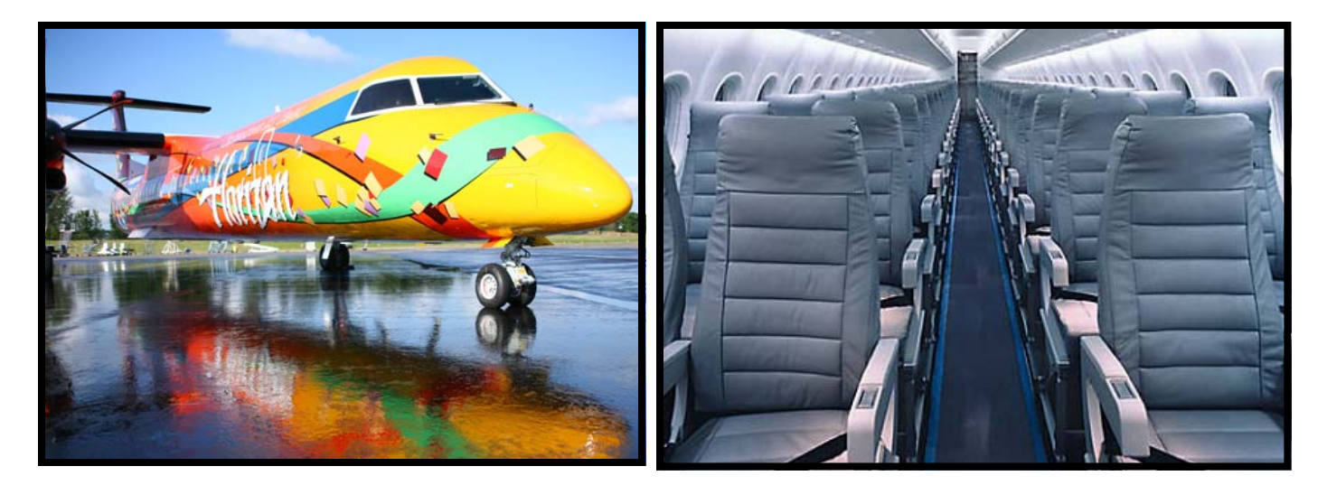
Horizon Air Q400 Exterior and Interior

Take advantage of introductory fares, tickets and reservations which are available now by calling I-800-547-9308 or visiting <u>www.horizonair.com</u>.